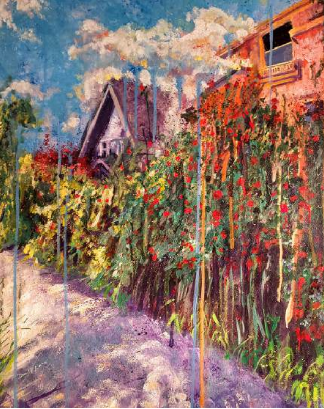
"The Enchantment" by Ian Shearer 2023 BEST IN SHOW

"The world of reality has its limits; the world of imagination is boundless."