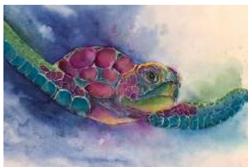
1st Place Deep Sea Diver by Tina Kabage